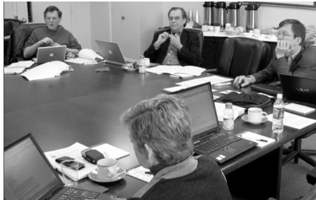
Members of the Lyman selection committee at work

The scholars recognized by the Lyman awards and appearing in this book, however, were never to be held back by fetishizing particular devices. They are the innovators who have theorized a more expansive future than computers or even phones can capture and who have accomplished important work animated by that vision. Well aware of the fragility of such constructions, we can call their imagination digital, in recognition that the fundamental underlying transition of our information age is the move from analogue (textured, powerful, noninteroperating) to digital (eminently interoperating, vastly powerful, but remarkably less textured and differentiated) representation of human knowledge and human cultural achievement. The essays here open windows into their vision and that future.